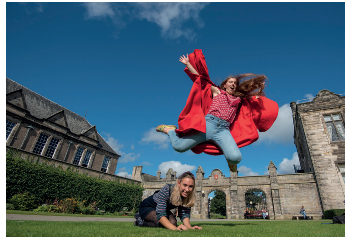
Jumping for joy in the Quad

Thank you – we couldn't do any of this without you.