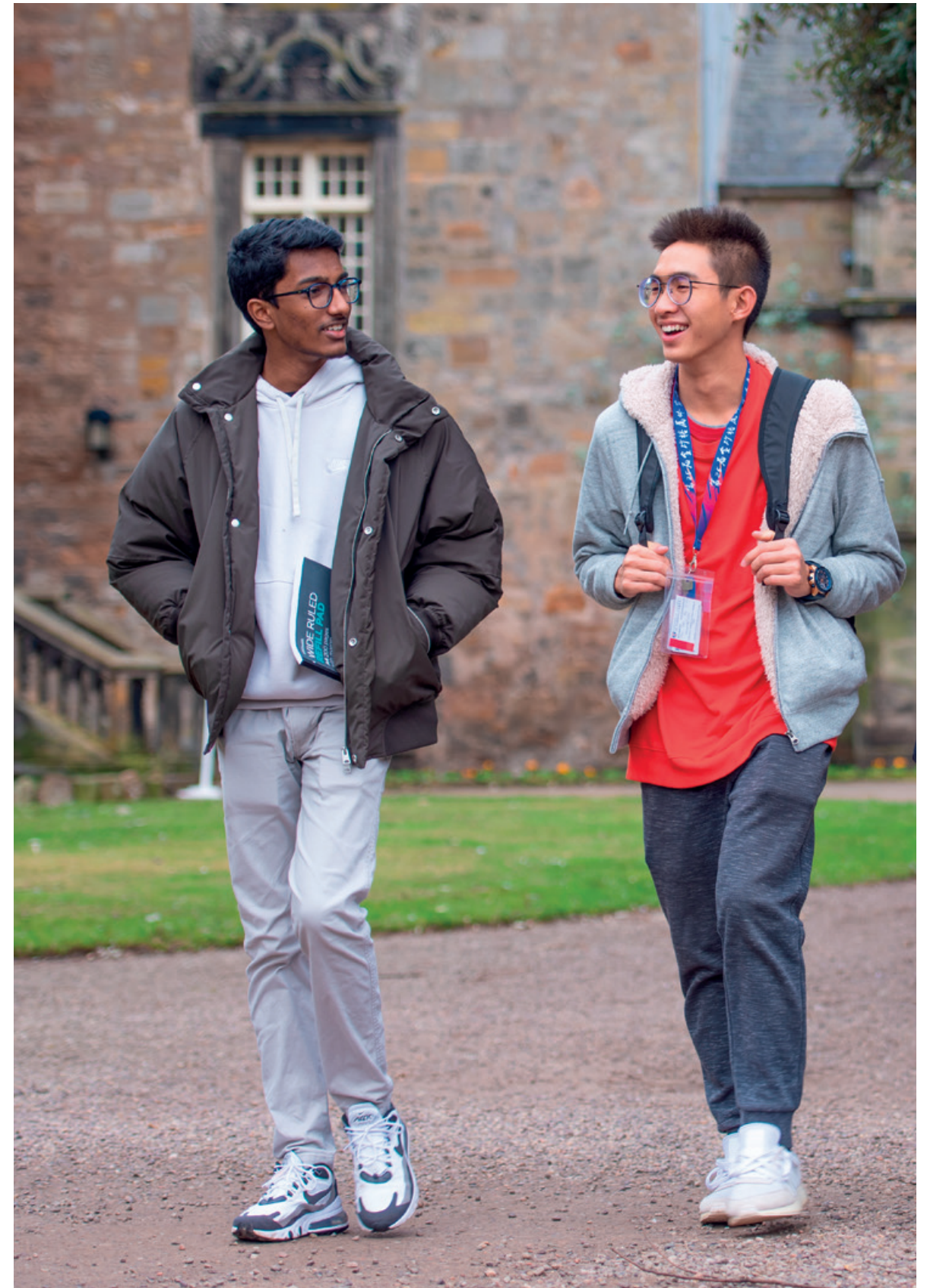
Friends walking in St Mary's Quad

Gifts were also received from 429 anonymous donors