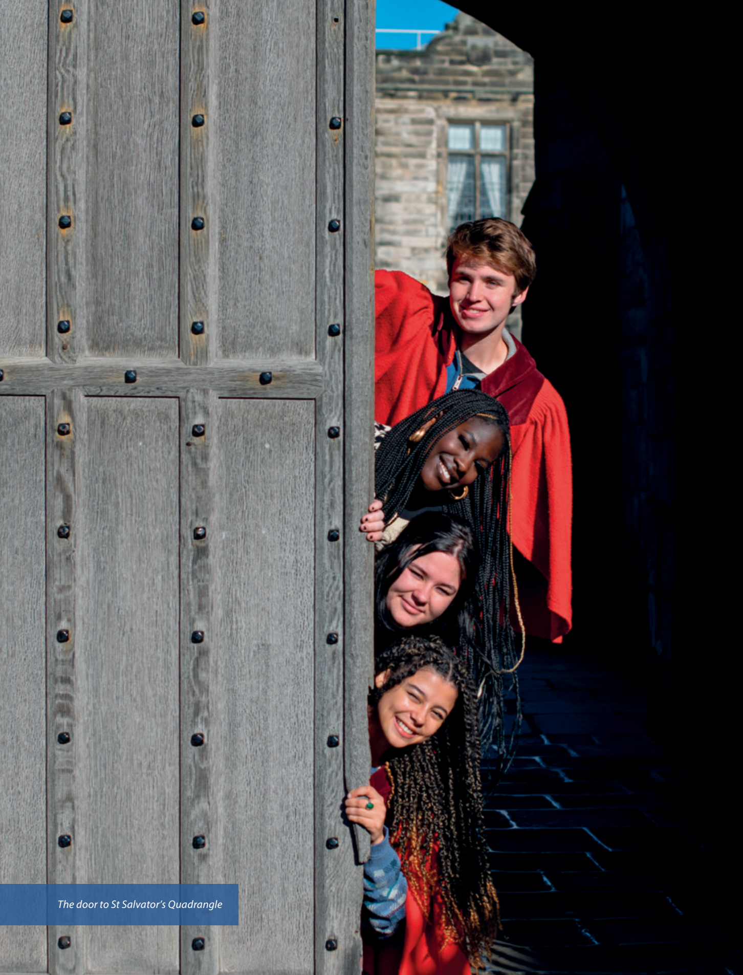
The door to St Salvador's Quadrangle